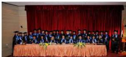
SHARJAH KHALIFA MEDICAL CITY Hosted by Sharjah Medical City International Interprofessional Wound Care Course (IIWCC) in Collaboration with University of Toronto Continuing Professional Development March 10, 2023

For Payment check the details on Registration Form